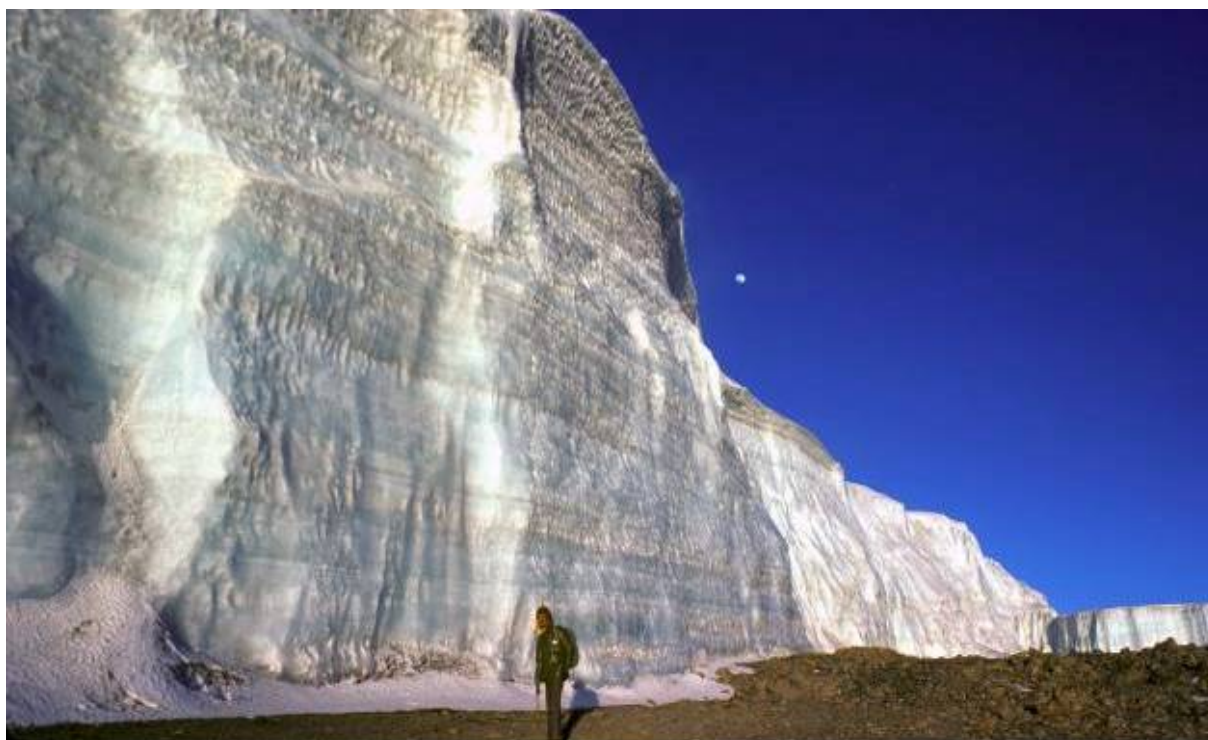
Ice on Kilimanjaro summit

After breakfast we descend the park gate. This can be a wonderful walk through the mountain forest - superb scenery and plenty of birds and calls of the colobus monkeys. We have chance to freshen up in our day room at our hotel before our flight. Transfer to airport.