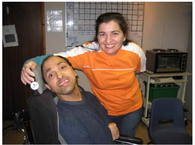
Parity Students spent time with Siemens staff.