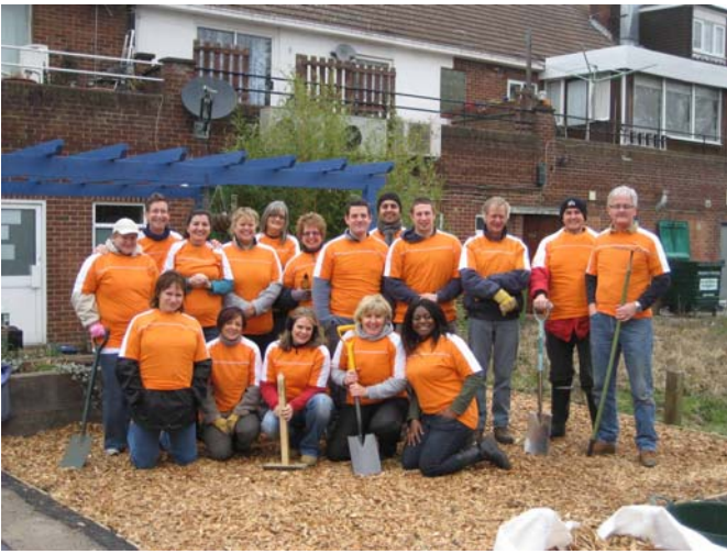
The Siemens Team