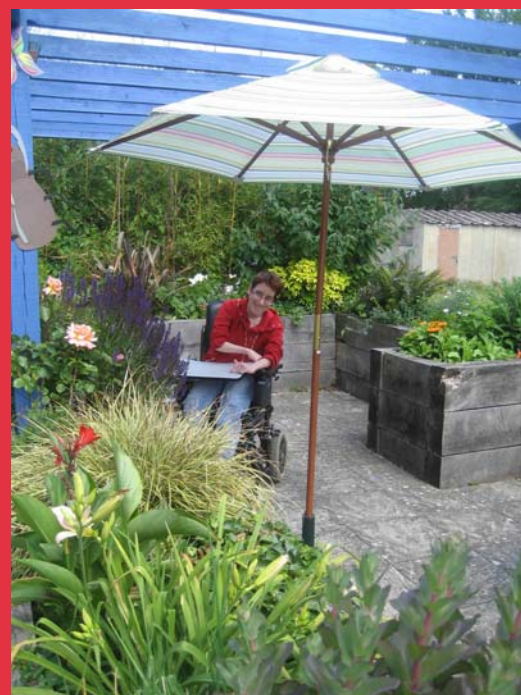
Victoria stays cool.

Want to run for Parity? Entries are now open for the popular Bath Half which takes place in March 2012..visit www.bathhalf.co.uk . Entries for the next Fleet Half open in September..visit www.fleethalfmarathon.com . To view the many options visit www.runnersworld.co.uk . We'll support you all the way!